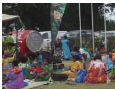
Local villagers on a Sunday