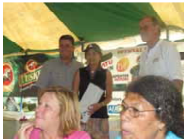
Mei's presentation with PGA Rep & Tournament