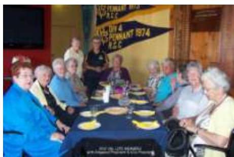
VGL life members

On Monday 12th. November, Ringwood golf course was the venue for the VGL Lady Life Members' Trophy event Ringwood Ladies catered for the players and officials, generating a financial bonus for the club.