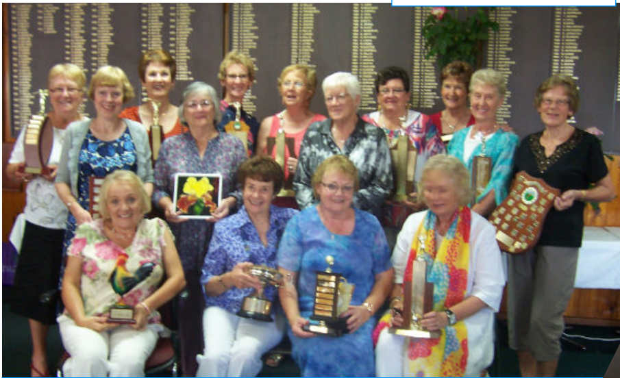
Major trophy winners