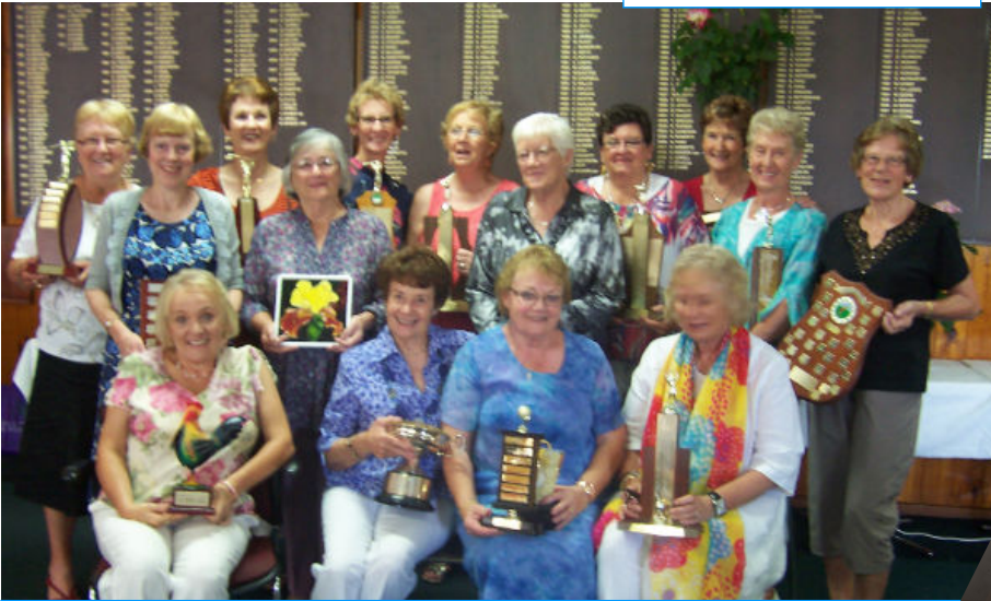
Major trophy winners