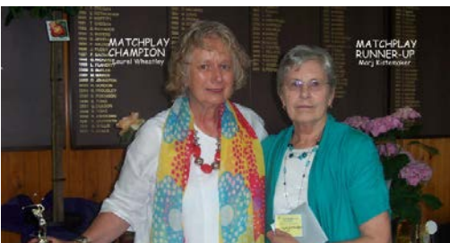
Matchplay winner and runner-up