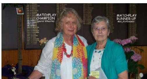
Matchplay winner and runner-up