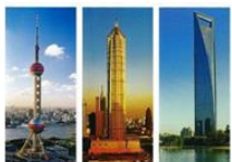
Oriental Pearl TV tower, Jinmao Tower and World Financial Centre (the Bottle Opener).

Shanghai is very western in many respects - lots of French, English and American influence architecturally and also in the arrangements of streets, boulevards and gardens. Travelled on the fastest train in the world, the MagLev - 30k to the airport and back again, reaching 450kph! - 13 mins each way and then projected up 421 mtrs in the lift of the Jinmau building - 45 seconds each way.