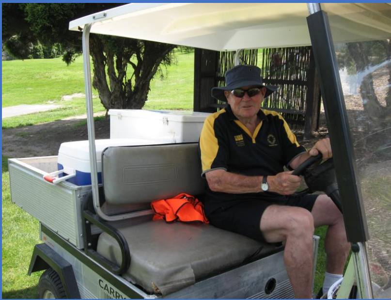
The Ringwood Golf Club 2014 Charity Day is being held on Friday 14 November