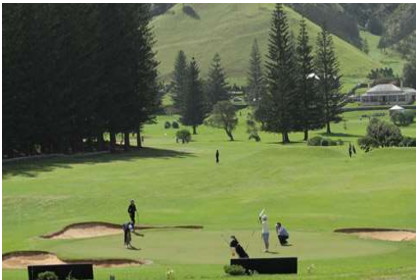
Norfolk Island Golf Club