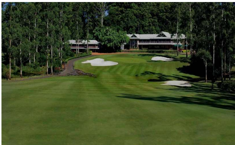
Bonville Golf Club, Coffs Harbour NSW